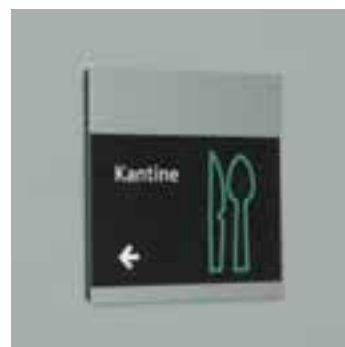
A5 Paperflex sign