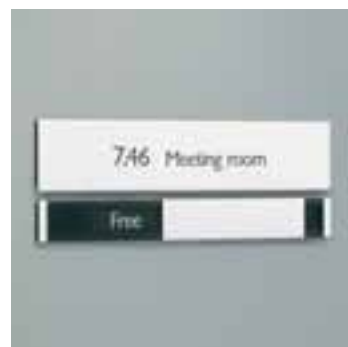
Meeting room signs