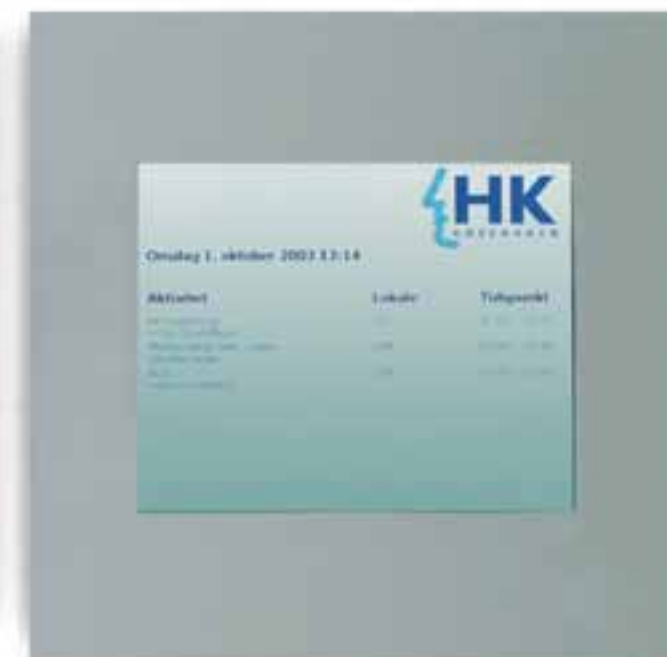
Electronic information sign