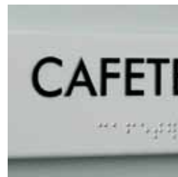
Wall sign with Braille